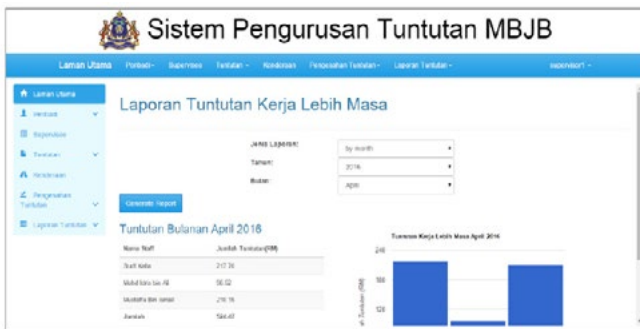
Figure 5 Generate Overtime Work Claim Report page