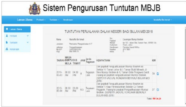
Figure 3 Mileage Claim Form page