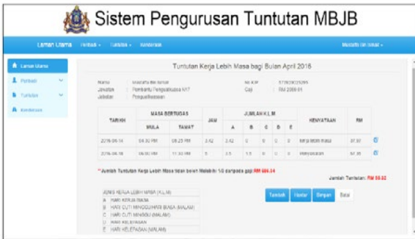
Figure 4 Overtime Work Claim Form Interface