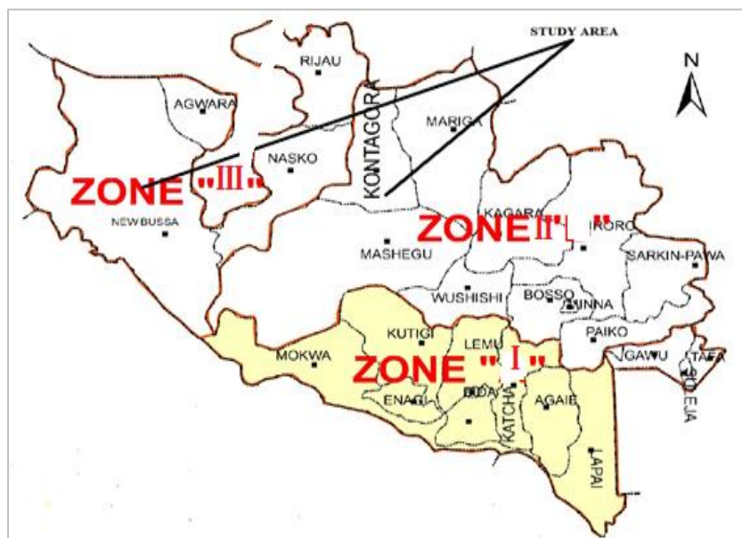
Figure 2: Map of Niger State Showing Kontagora LGA